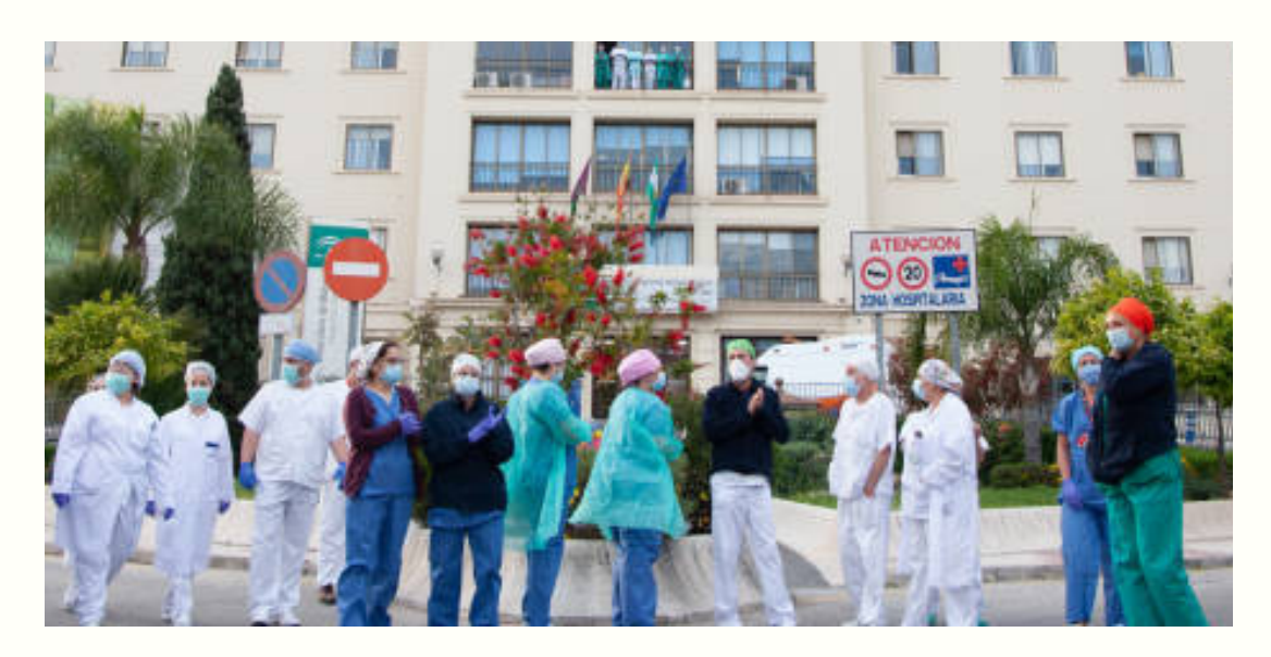
Healthcare workers on strike for better benefits and working conditions

In the last year, the healthcare system in America has experienced a series of significant events, two of which were the strikes by Kaiser Permanente unions. The strikes, fueled by the frustration of healthcare workers grappling with low pay, burnout, and understaffing, not only disrupted patient care, but also prompted the health giant to make a 'historic' deal, signaling a major turning point for healthcare workers nationwide.