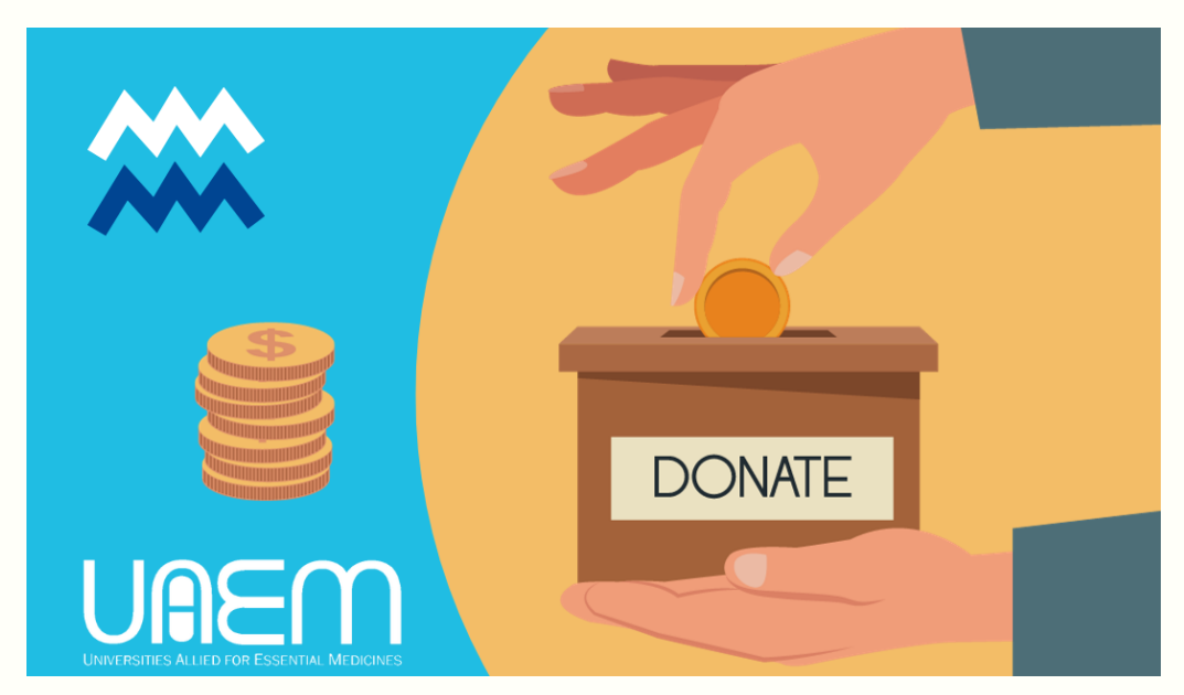
UAEM Giving Tuesday Ad, from UAEM UNC Donation Posts

By raising awareness on issues that are meaningful to a group and mobilizing people around important causes, grassroots fundraising nurtures a sense of community and empowerment among supporters, encouraging not only monetary contributions but also the sharing of time, skills, and resources. For student activists, this method is about more than just securing funds; it's a platform for education, skill-building, and fostering a deeper connection with the values they champion.