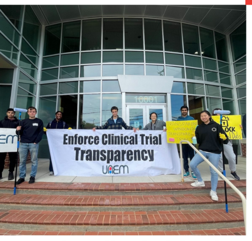
UAEM Johns Hopkins University hosted a protest in 2023 at the Food and Drug Administration, pushing for more transparency in clinical trials.