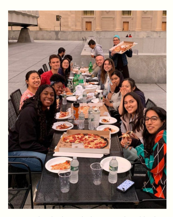
UAEM student leaders enjoying an evening of food and friendship during the Leadership Workshop.